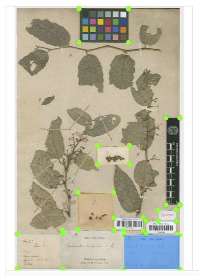
Figure 2. Annotation of noise elements.

In the first stage, we manually annotated the images using bounding boxes in a dataset of 950 images. We identified (Fig. 2) the visual elements considered to be noise (e.g., scalebar, barcode, stamp, text box, color pallet, envelope). Then we trained the model to automatically remove the noise elements. We divided the dataset into 80% training, 10% validation and 10% test set. We ultimately achieved a precision score of 98.2%, which is a 3% improvement from the baseline. Next, the results of this stage were used as input for image segmentation, which aimed to generate the final mask. We blacken the pixels covered by the detected noise elements, then we used HSV (Hue Saturation Value) color segmentation to select only the pixels with values in a range that corresponds mostly to a plant color. Finally, we applied the morphological opening operation that removes noise and separates objects; and the closing operation that fills gaps, as described in Sunil Bhutada et al. (2022) to remove the remaining noise. The output here is a generated mask that retains only the pixels that belong to the plant. Unlike other proposed approaches, which focus essentially on leaves and stems, our approach covers all the plant organs (Fig. 3).