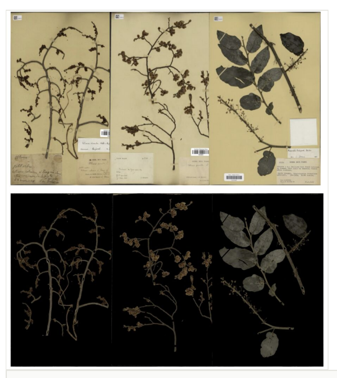
Figure 3. Examples of image segmentation.

Our approach removes the background noise from herbarium scans and extracts clean plant images. It is an important step before using these images in different deep learning models. However, the quality of the extractions varies depending on the quality of the scans, the condition of the specimens, and the paper used. For example, extractions made from samples where the color of the plant is different from the color of the background were more accurate than extractions made from samples where the color of the plant and background are close. To overcome this limitation, we aim to use some of the obtained extractions to create a training dataset, followed by the development and the training of a generative deep learning model to generate masks that delimit plants.